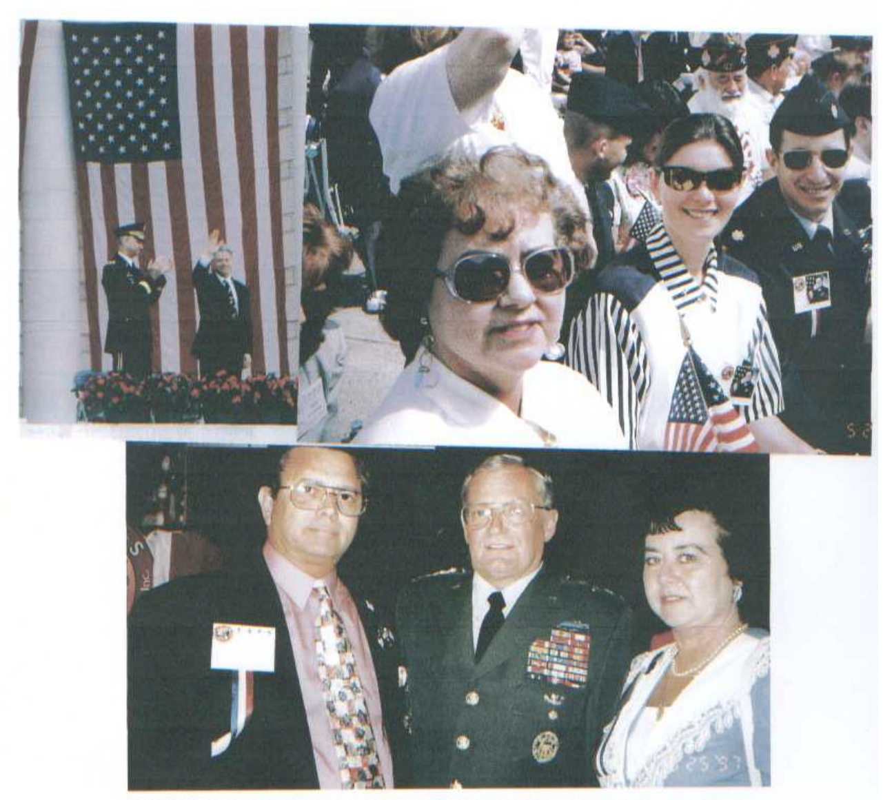
INFORMAL MEETING WITH GENERAL SHALI AT TAPS 98